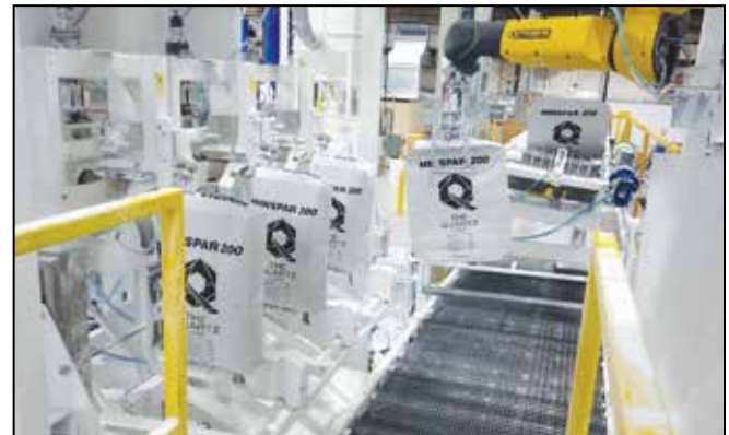
Three Model A Valve Bag Fillers with Robotic Bag Placing.

One Partner For All Your Material Handling Needs.