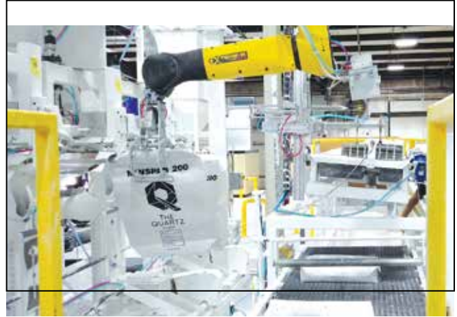
Model TRV-1000 robot placing 50 lb bags.