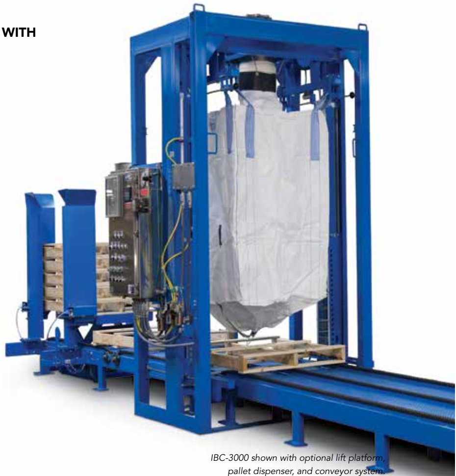
IBC-3000 shown with optional lift platform, pallet dispenser, and conveyor system.

One Partner For All Your Material Handling Needs.